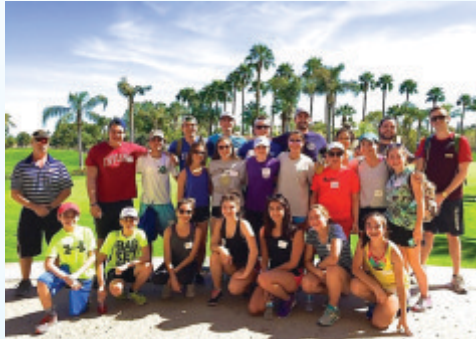
Youth Outing at 25th Annual Conference in Scottsdale, Arizona.