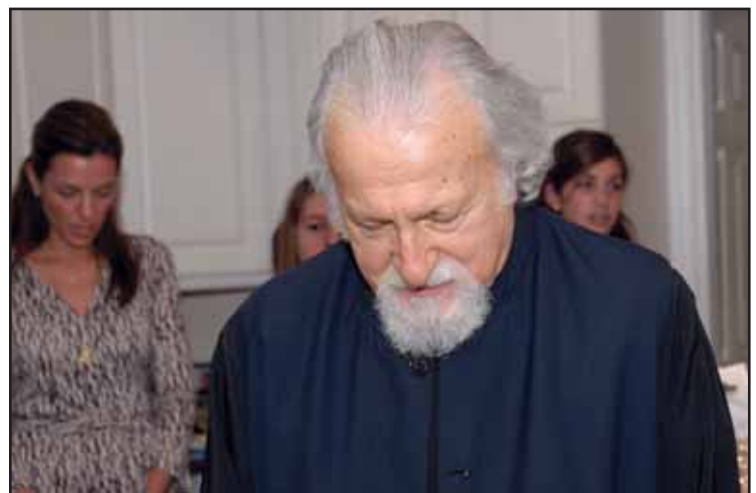
Metropolitan Isaias of Denver gives blessing at L100 luncheon.