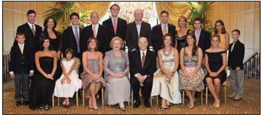
The Anton clan gathers for the celebration.