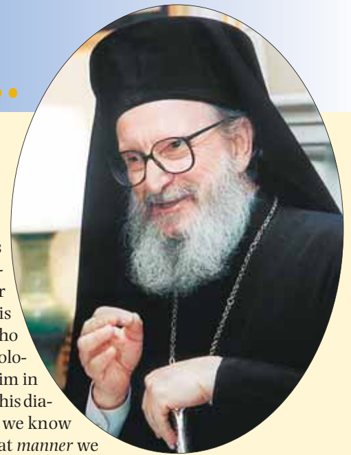
DEMETRIOS Archbishop of America