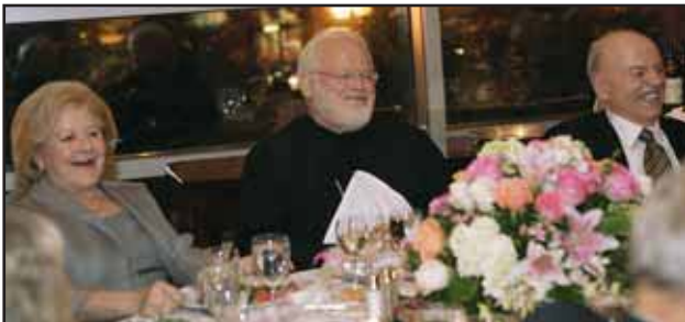
The Antons with Metropolitan Methodios of Boston.