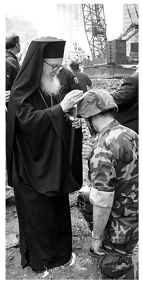
His Eminence at Ground Zero

The final part of the series on the environment, a description of an international conference at Holy Cross sponsored by Leadership 100, has been postponed for the next issue.