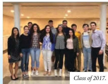
Class of 2017.

One of the primary purposes of the organization is to respond to catastrophic emergencies including but not limited to death, medical necessities, and financial shortcomings within 48 hours. The organization has already provided financial assistance in many emergencies, such as support of a struggling